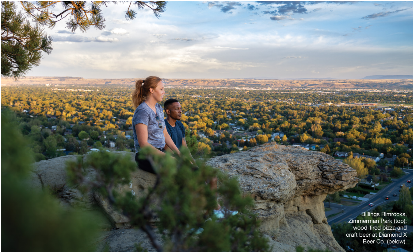
Billings Rimrocks, Zimmerman Park (top); wood-fired pizza and craft beer at Diamond X Beer Co. (below).

Distance: Approximately 500 Miles | Days: 4–5