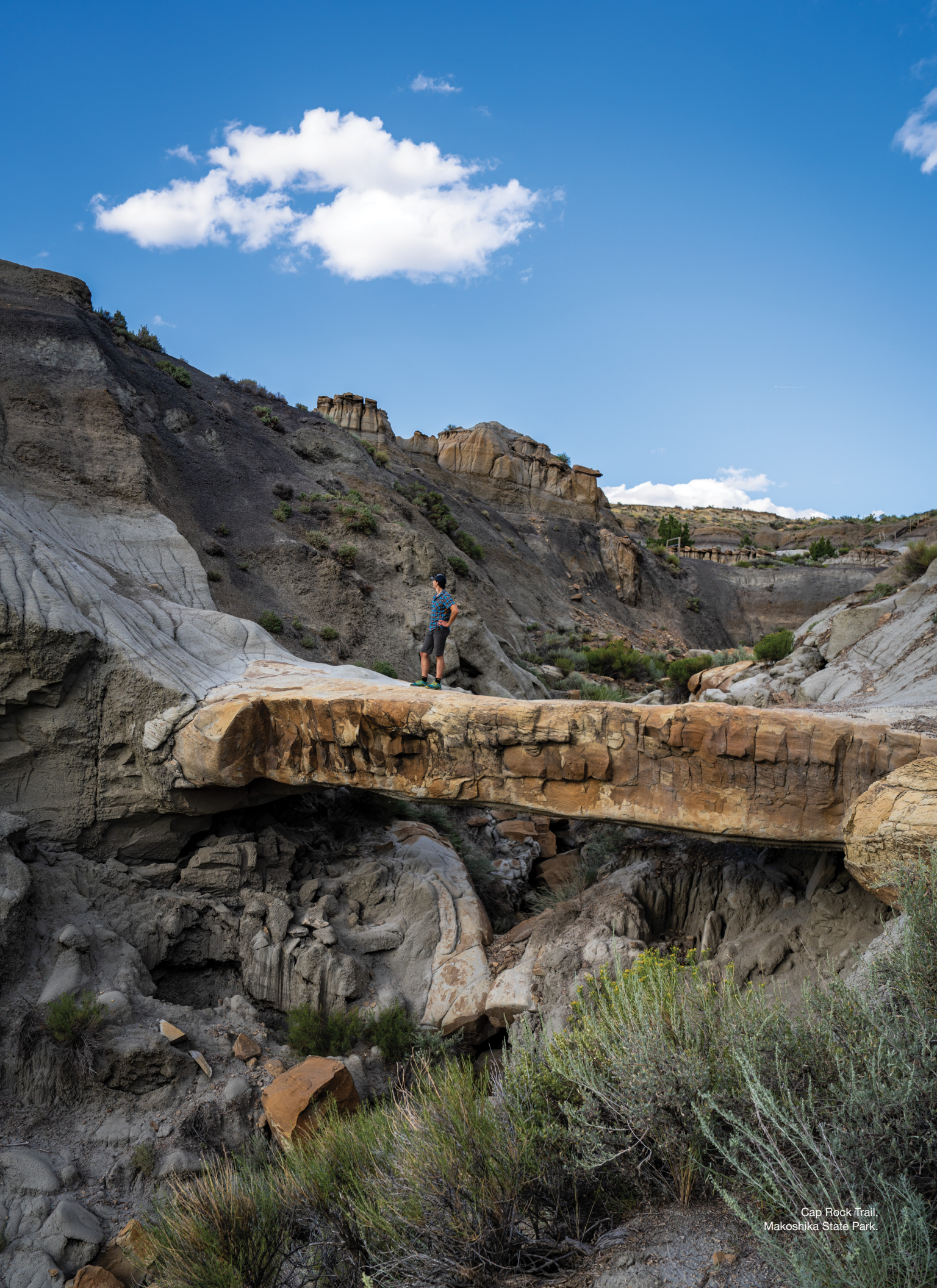
Cap Rock Trail, Makoshika State Park.