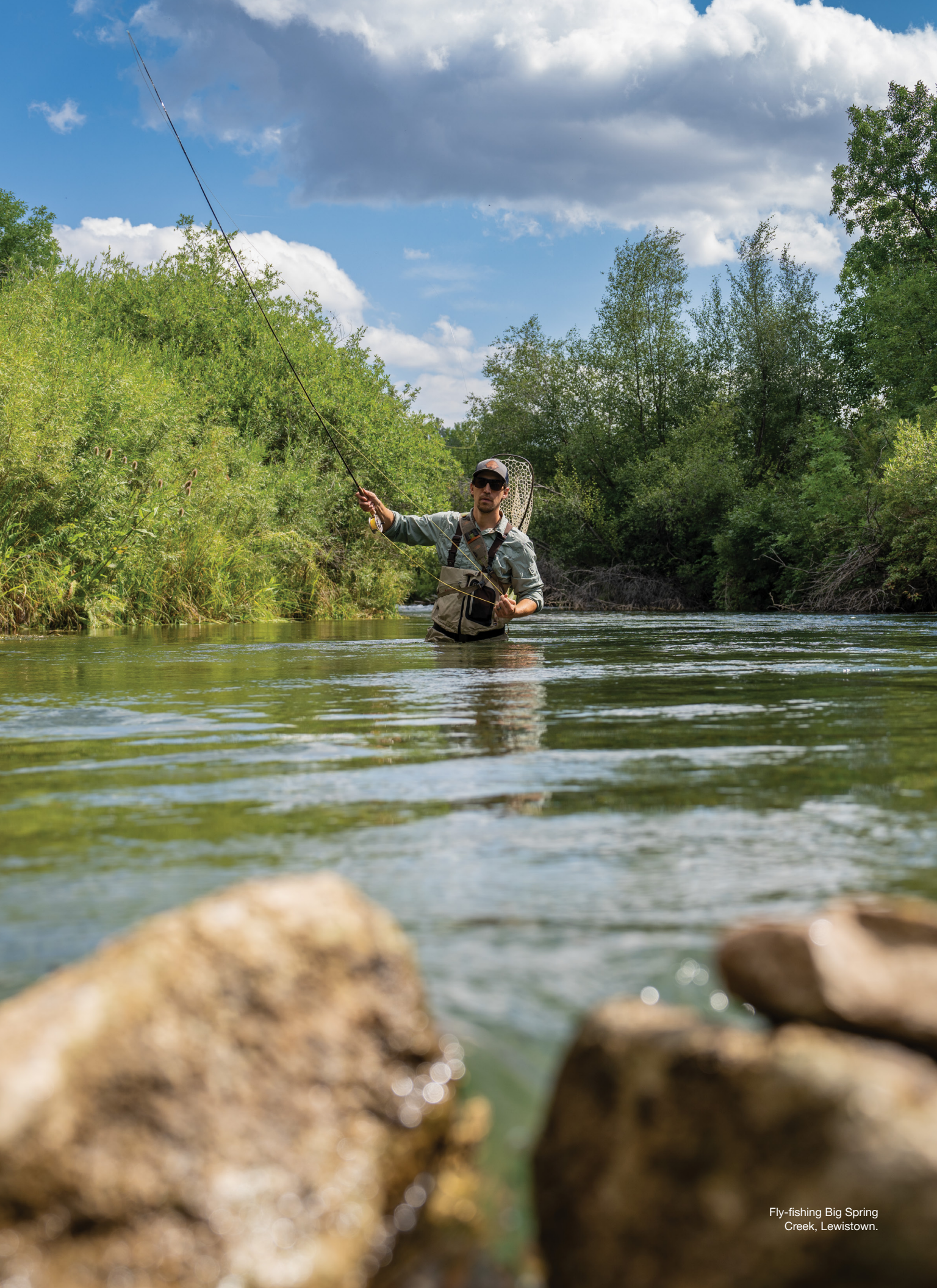
Fly-fishing Big Spring Creek, Lewistown.