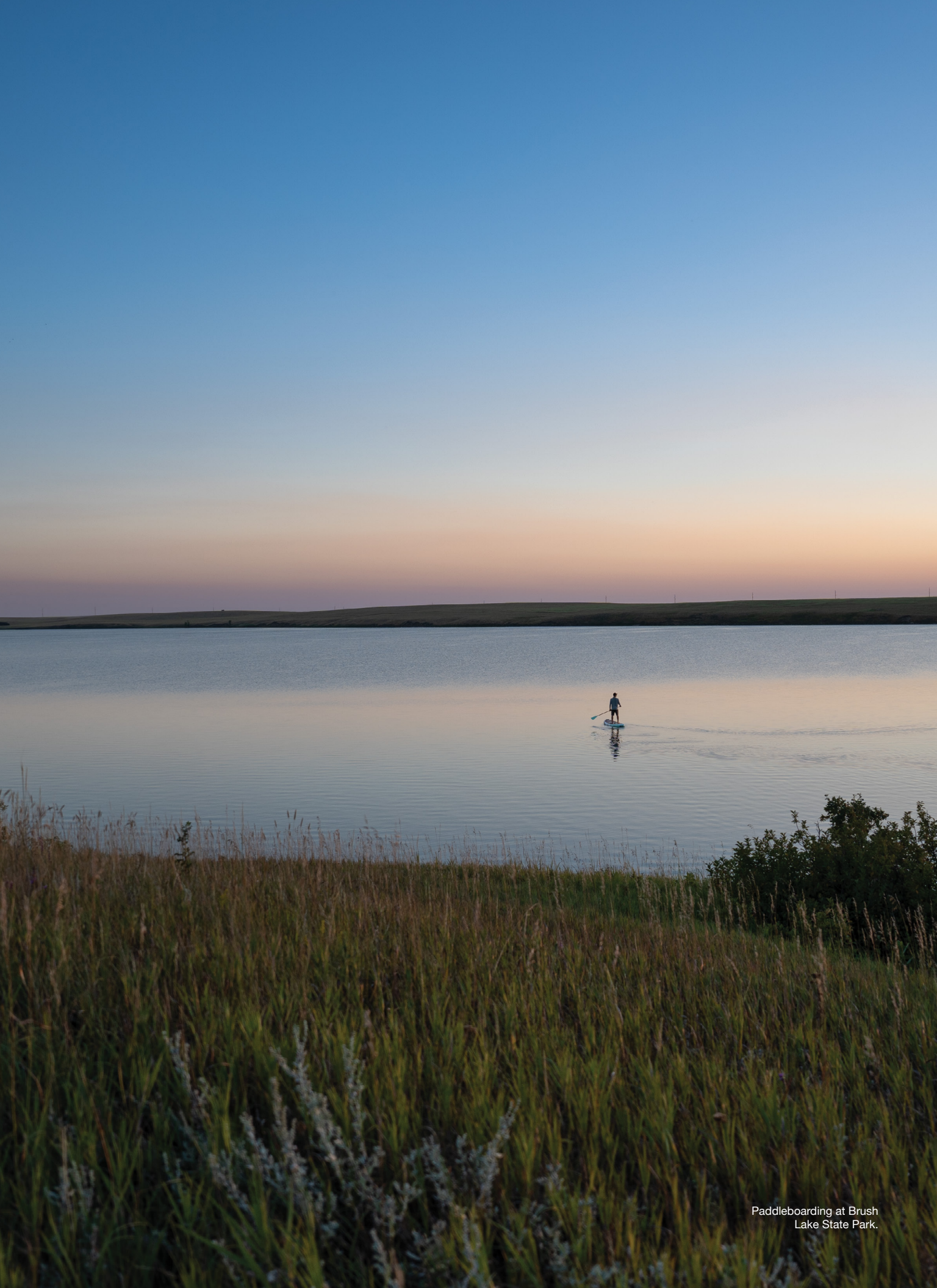
Paddleboarding at Brush Lake State Park.