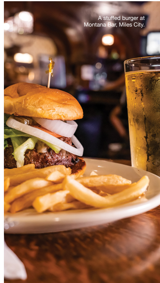
A stuffed burger at Montana Bar, Miles City.