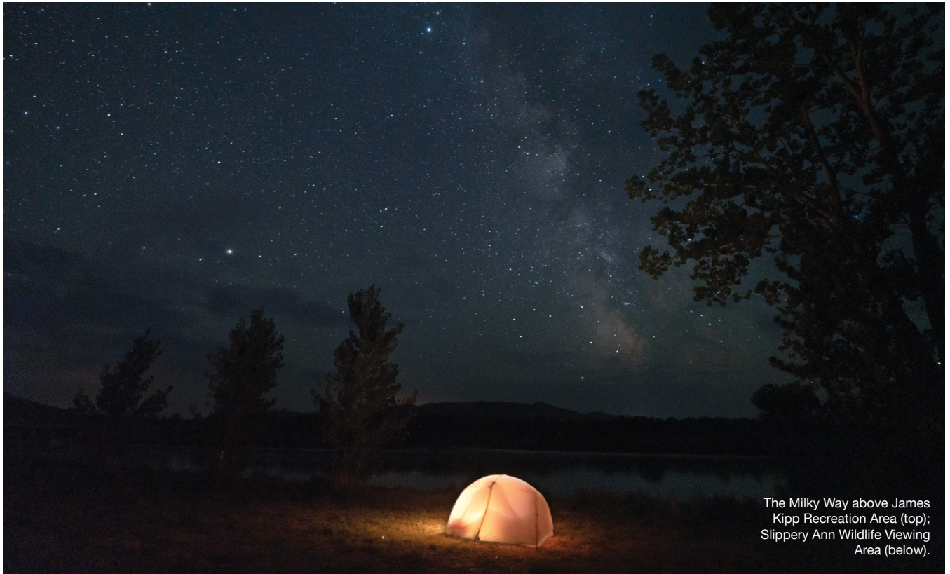
The Milky Way above James Kipp Recreation Area (top); Slippery Ann Wildlife Viewing Area (below).

Distance: Approximately 564 Miles | Days: 3–5