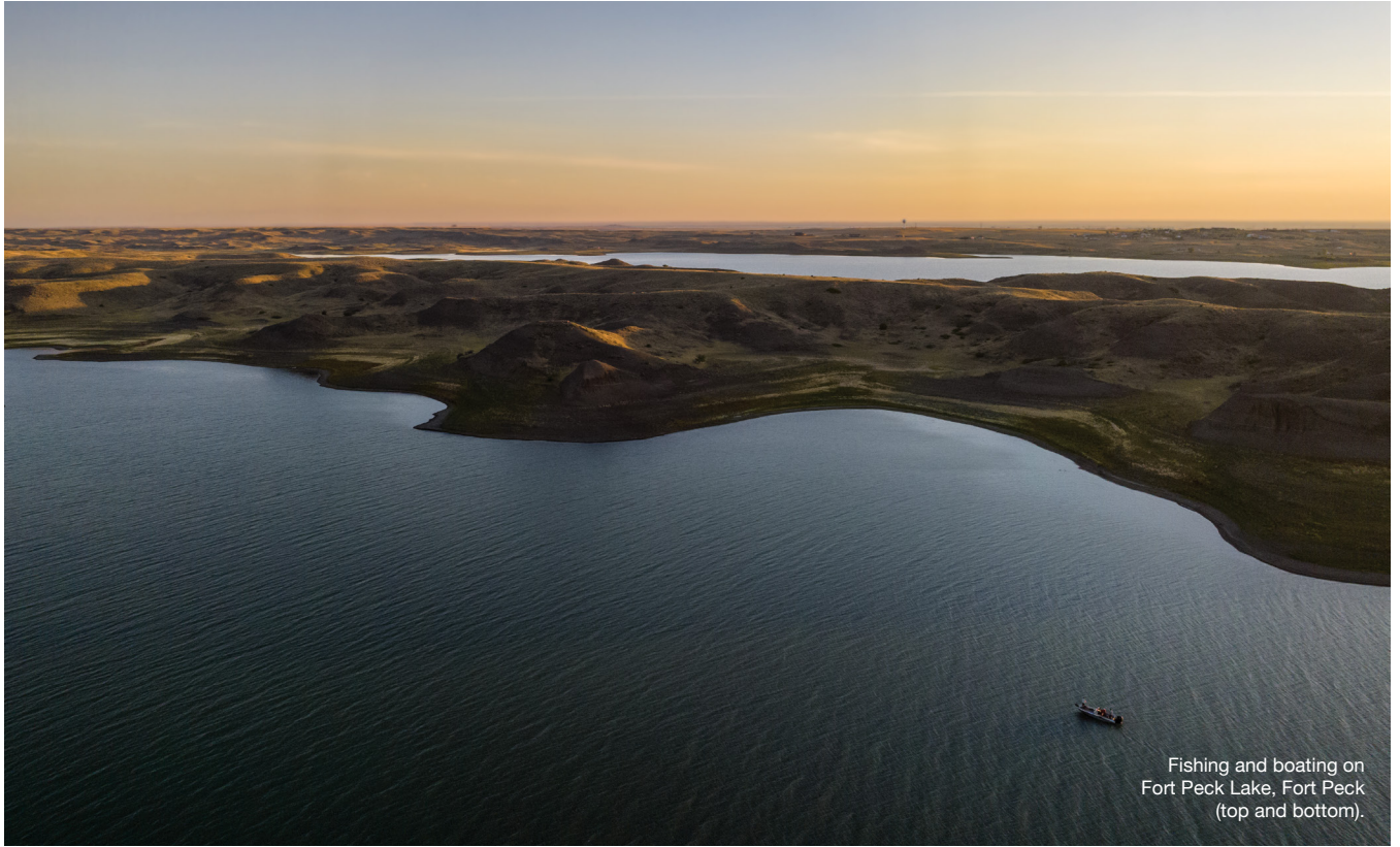
Fishing and boating on Fort Peck Lake, Fort Peck (top and bottom).

Distance: Approximately 500 Miles | Days: 4–5