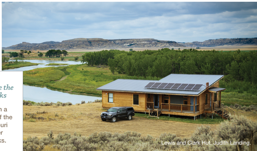
Lewis and Clark Hut, Judith Landing.

North of Lewistown, the Missouri River carves a vast channel through some of the most wild and scenic country in North America. For 149 river miles, from the town of Fort Benton to James Kipp Recreation Area , the Missouri is protected as a national monument spanning some 380,000 acres of shoreline, forest, prairie, badlands, and coulees—all of it home to countless species of wildlife and plants. One visit is all it takes to understand why these areas surrounding the Missouri River are known as “breaks”—as you approach the river, the undulating prairie seems to break away all at once, revealing rugged badlands and cliffs that