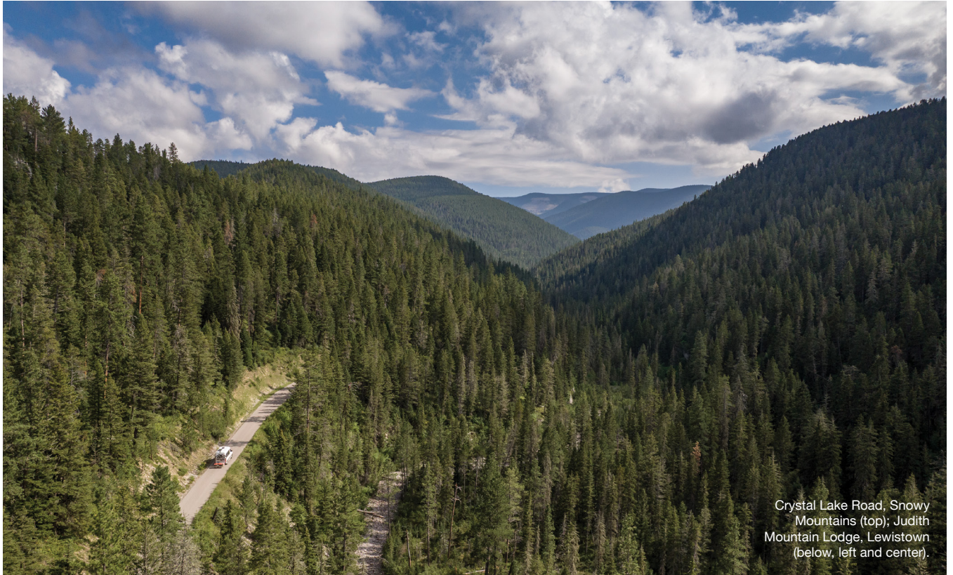
Crystal Lake Road, Snowy Mountains (top); Judith Mountain Lodge, Lewistown (below, left and center).

Distance: Approximately 335 Miles | Days: 3–5