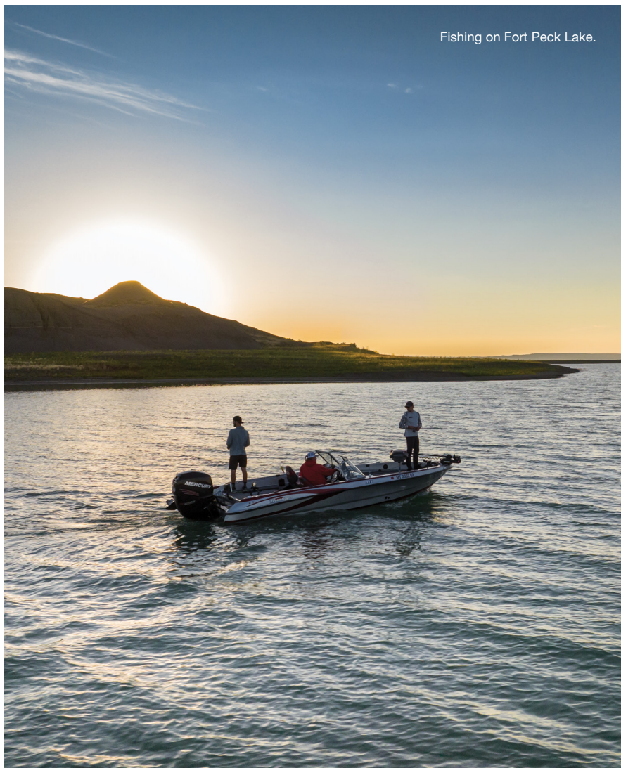
Fishing on Fort Peck Lake.

If you look at a dark-sky map of Montana, the shading around Hell Creek Recreation Area indicates excellent conditions for stargazing. That's because it's a long way from pretty much everywhere—Jordan, the closest town, 25 miles to the south, has a population of less than 500. And just like at Medicine Rocks, jaw-dropping views of the Milky Way's galactic center are just one part of the experience at Hell Creek. The recreation area campground and boat launch are located on the scenic south shore of Fort Peck Lake , an immense reservoir of the Missouri River, and are managed by the Little Shell Tribe of Chippewa Indians. Launch a canoe, kayak, or SUP to explore the many secluded coves nearby. Or link up with a local fishing guide for an excursion on the lake in search of walleye, lake trout, Chinook salmon, or northern pike, depending on